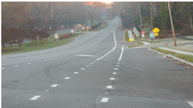
New acceleration and deceleration lane for the entrance of Admiral's Ridge on Route 2

APC is tracking closely the application for a commercial self-storage facility on Route 2 between the Serv Pro and Arnold Veterinary Hospital on the Jordan property. Look for a resolution soon to cast your vote and give APC a chance to present a position to Planning & Zoning and at the special exception hearing.